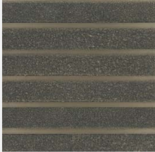
BIRRUS ULTRAMAT ANODISED Antique Bronze