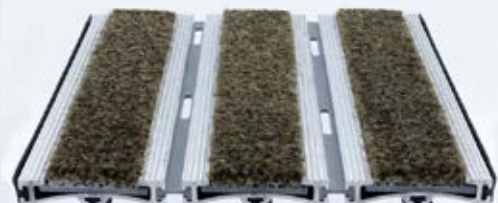
Open Construction Slimline 10mm