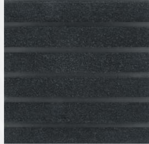
BIRRUS ULTRAMAT ANODISED Midnight Black