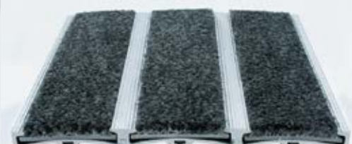
Closed Construction 10mm & 16mm